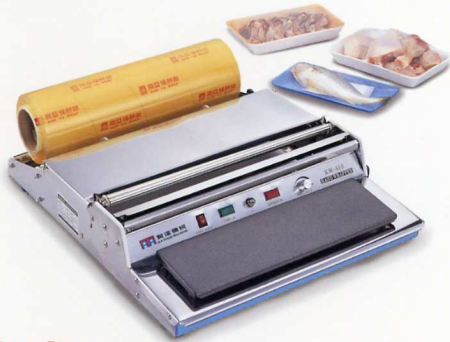
AA-450 Series 保鮮膜包裝機 FILM PACKAGING MACHINE