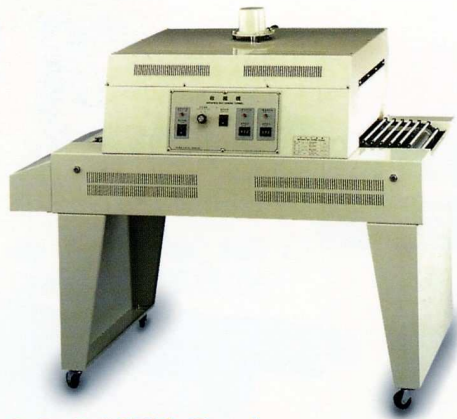
AA-311FH Series 收縮包裝機 SHRINKING MACHINE

Our affiliated company is specialized in manufacturing packaging machine series.