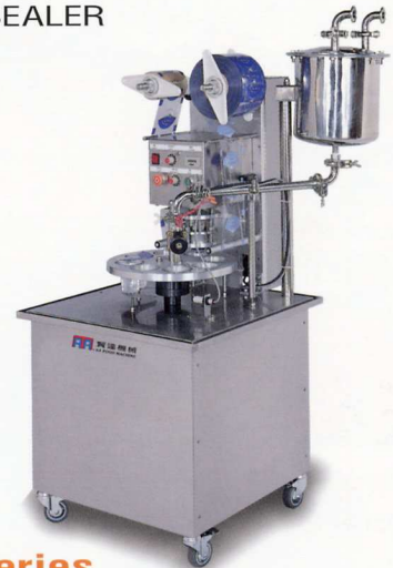
CE AA-2201 Series 轉盤式全自動落杯充填封口機 FULLY AUTOMATIC ROTARY TYPE CUP FILLING AND SEALING PACKAGING MACHINE