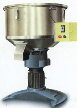
AA-100M/200M 直立式混合攪拌機 VERTICAL TYPE MIXER