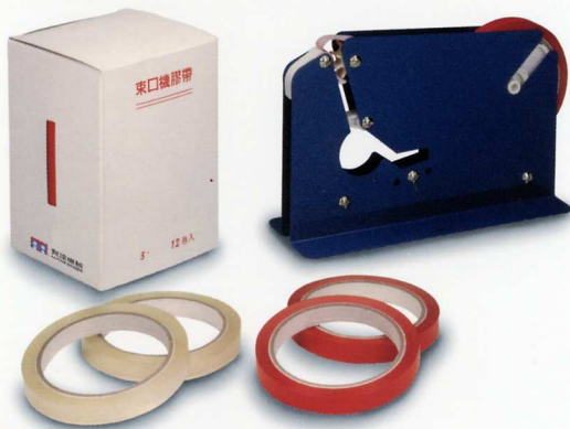
AA-121 塑膠袋束口機 PLASTIC TYING MACHINE