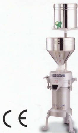
AA-05FE Series 磨豆機 HIGH SPEED GRINDING MACHINE