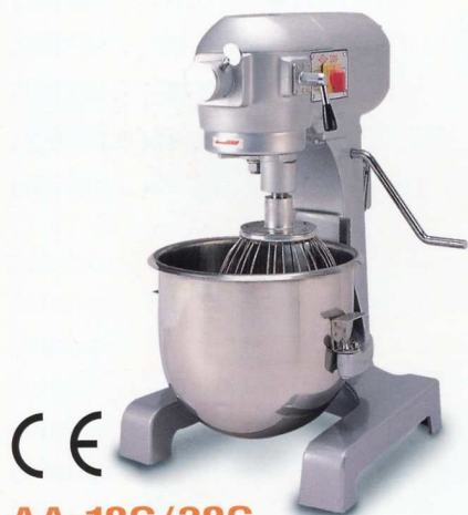
AA-10G/20G 食品攪拌機 FOOD MIXER