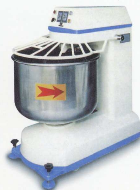
AA-70B/90B/200B/260B 食品攪拌機 FOOD MIXER