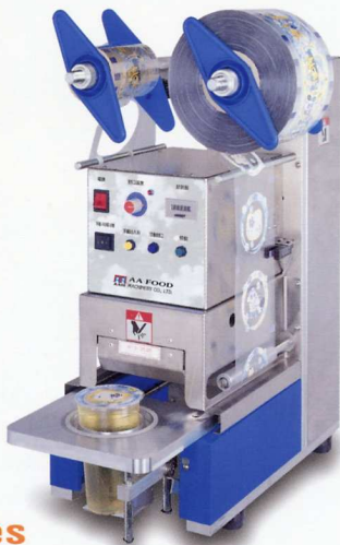
CE AA-888 Series 桌上型盒 • 杯封口機 BENCH BOX • CUP SEALER