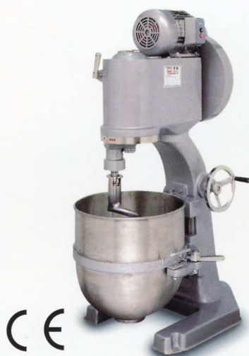
AA-80B/90B/140B 食品攪拌機 FOOD MIXER