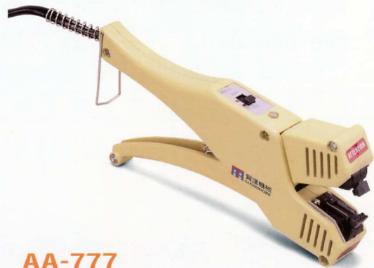
AA-777 手提式封盒機 HANDY BOX SEALER