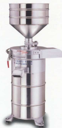
AA-16F Series 快速磨豆. 磨米脫渣機 HIGH SPEED GRINDING • SEPARATING MACHINE