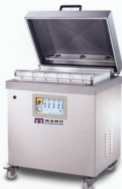
AA-700 Series 自動真空封口包裝機 AUTOMATIC VACUUM SEALING MACHINE