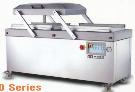
CE AA-1000 Series 雙槽式真空封口包裝機 DOUBLE CHAMBERS AUTOMATIC VACUUM SEALING MACHINE