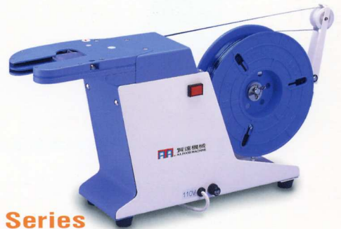
CE AA-210 Series 魔帶結束機 TWISTING TIE MACHINE